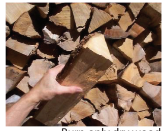
Burn only dry wood